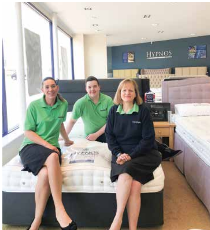
The Hypnos Collection – proud bearers of the Royal Warrant – is available to view at 98 Chester Road, Helsby and 14 Church Street, Frodsham.

To view the Hypnos Collection, visit www.landofbeds.co.uk/hypnos