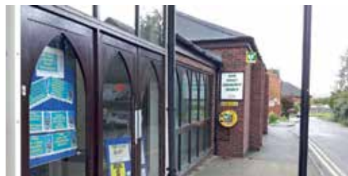
Relocated defibrillator at Main Street Community Church