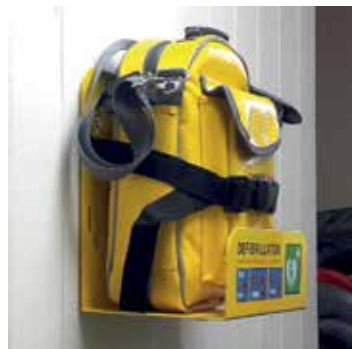
New defibrillator at District Taxis office

Always dial 999 in an emergency. The Ambulance Service will tell you where the nearest defibrillator is located, if it is available to be used, and whether it is required.