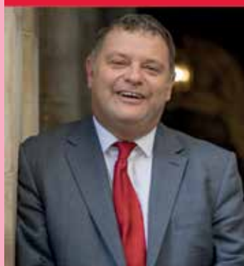
Mike Amesbury Labour MP for Weaver Vale