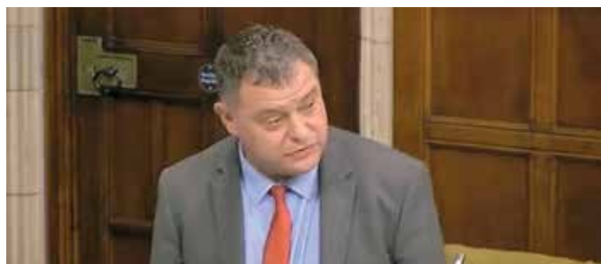
LOCAL MP Mike Amesbury says raising the state pension age has had a 'devastating' impact on women born in the 1950s.

The Weaver Vale MP and Shadow Minister for Employment was speaking during a debate in Westminster Hall.