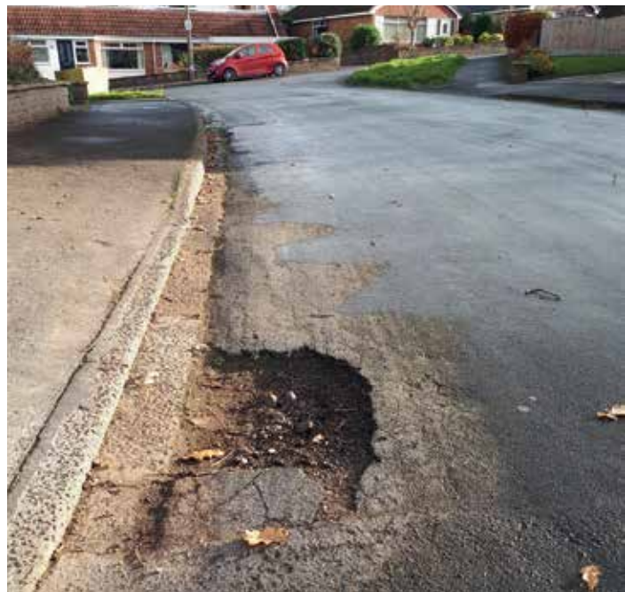
A pothole in Overton Drive, Frodsham.

road maintenance and is on top of £900 million that the Government already provides to councils across the country this year for local highways maintenance."