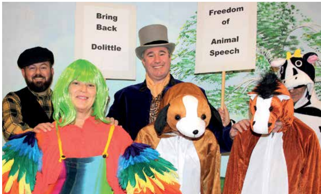
Kingsley Players cast in Dr Dolittle.