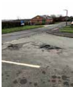
Potholes on Ashton Drive.

We drove through the potholes with the Chief Executive including on both Ashton Drive and Howey Lane so he could see just how badly his council is failing.